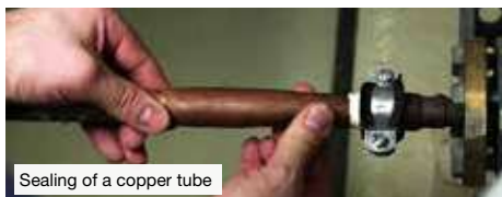
Sealing of a copper tube